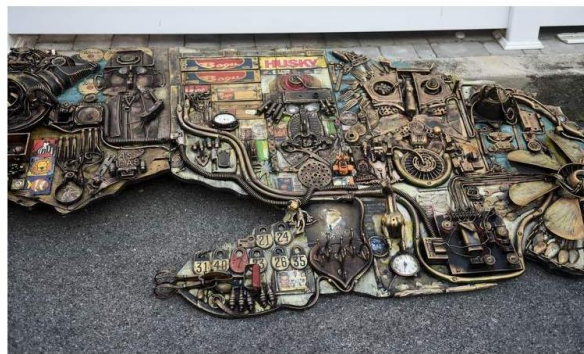
Sculpture that Cuban artist Julio César Cepeda Duque created was on display Thursday at a block party in the parking lot behind Art Plus Gallery in

The artist will be in Berks County for just two months.